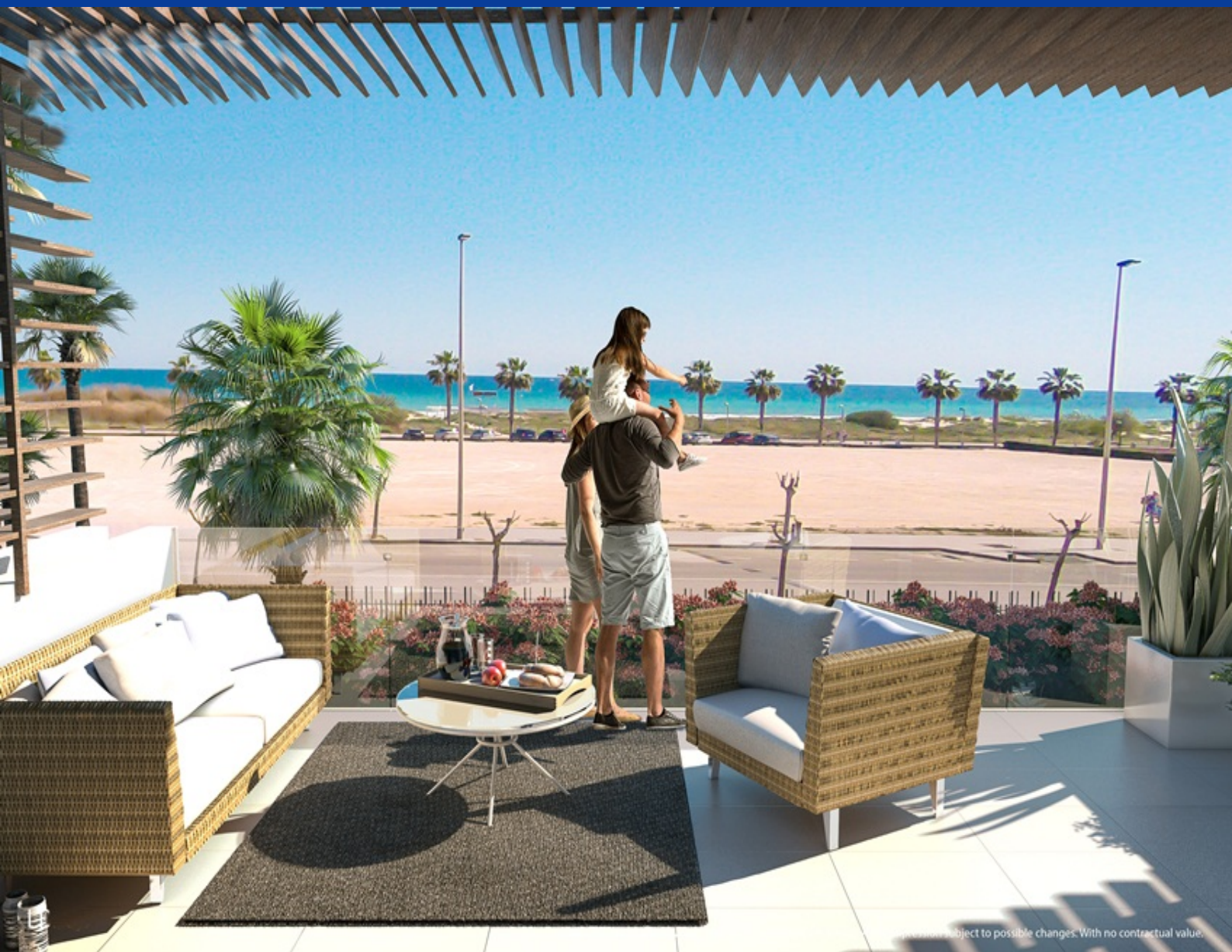
Image is subject to possible changes. With no contractual value.

Residential real estate / Flats and apartments / Costa Blanca / Pilar de la Horadada